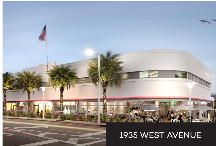
1935 WEST AVENUE