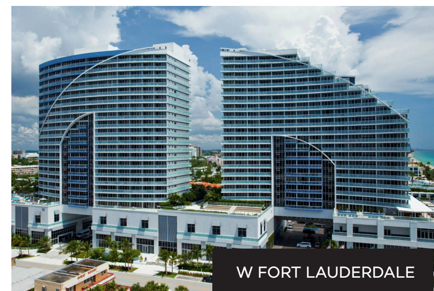
W FORT LAUDERDALE